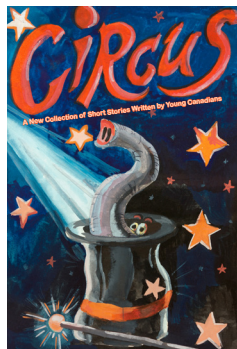
Circus Kindergarten - Grade 5