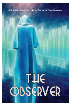
The Observer Grades 9-12

These magnificent books featuring the listed prize winners and many other excellent student writers are now available to purchase. Poetry contest results were released in June.