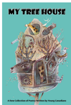
My Tree House Kindergarten - Grade 5

PO Box 500, Stn Main Maple Ridge, BC V2X 3P2 P 604.465.0755 F 604.465.0756 E polarexpressions@shaw.ca www.polarexpressions.ca