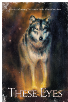
These Eyes Grades 9-12

These magnificent books featuring the listed prize winners and many other excellent student writers are still available to purchase in very limited quantities. Story contest results and books will be released in June.