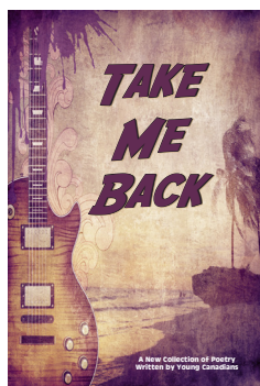
Take Me Back Grades 9-12

These magnificent books featuring the listed prize winners and many other excellent student writers are now available to purchase.